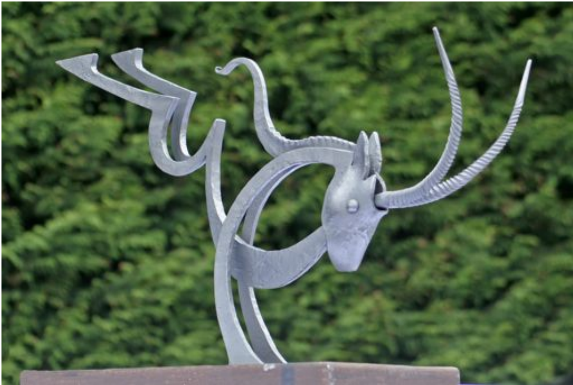
Leaping Sable Antelope made on an Intermediate course

The Intermediate Course , which can be run alongside the Beginners courses, allows past participants to utilise and practice the basic skills they have already learnt, while working on a project of their design and choice.